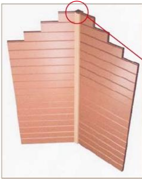
Two socket post (90°+45° - left)